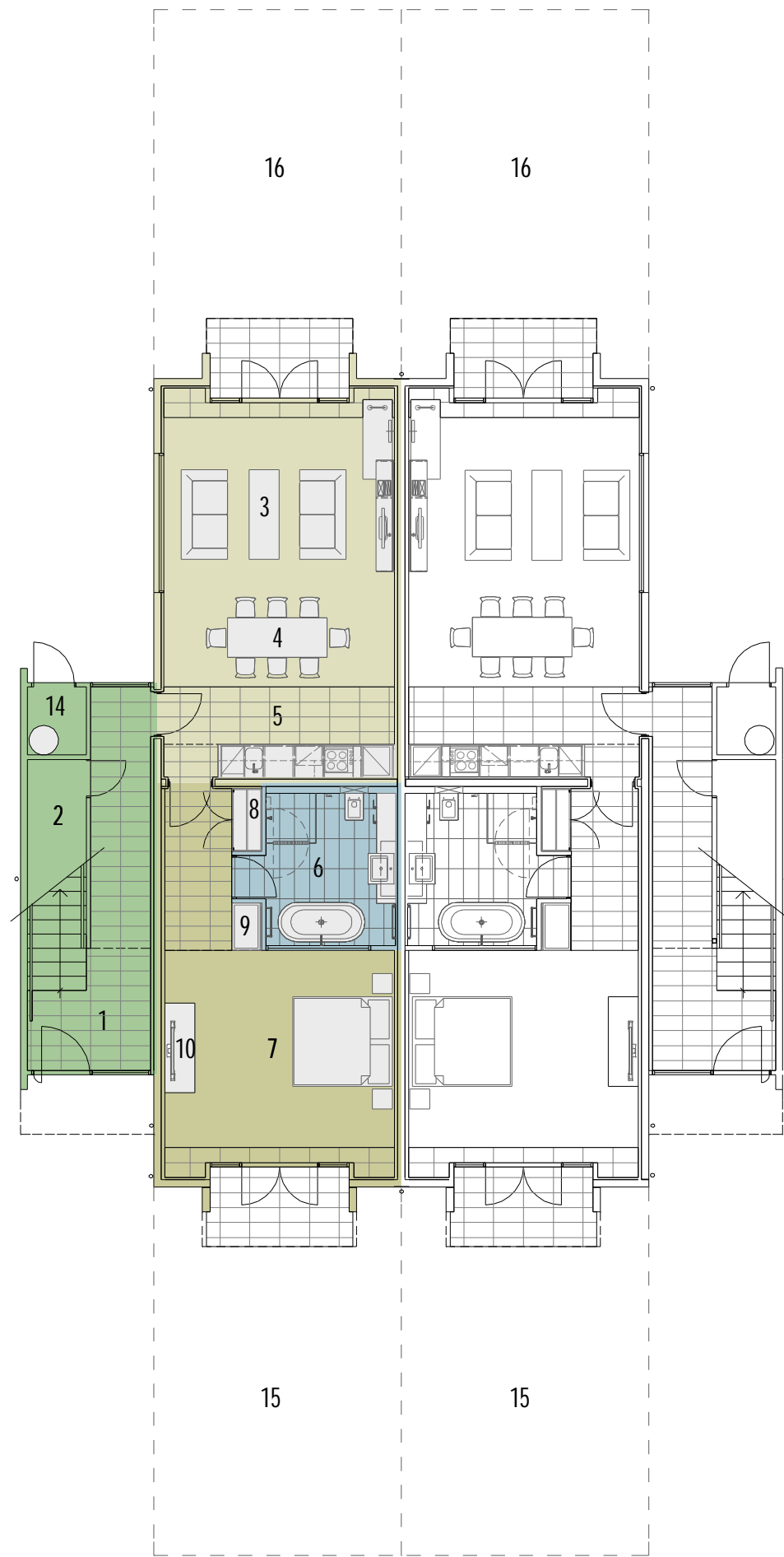
3 BED VILLA - GROUND FLOOR PLAN